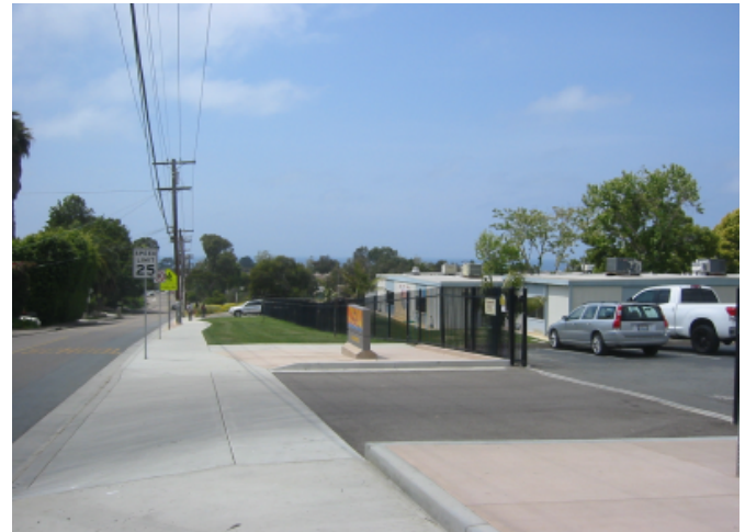
Front of Campus, Along Requeza Street, Looking South