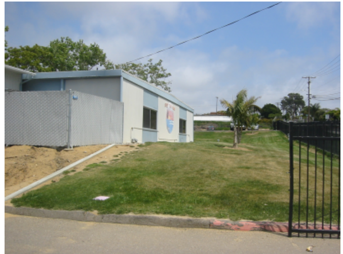
At Parking Entrance, Lower Tier of Site