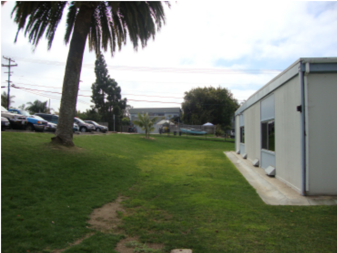
Area between Classrooms and Upper Parking Lot