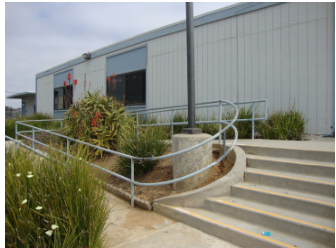
Stairs and Ramp for Campus Access