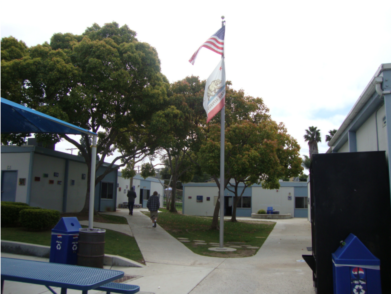
Center of Campus