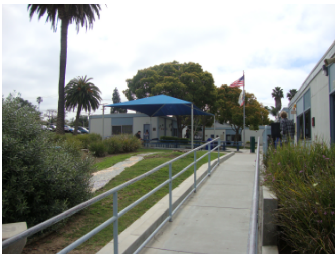
Walkway Leading to Administration