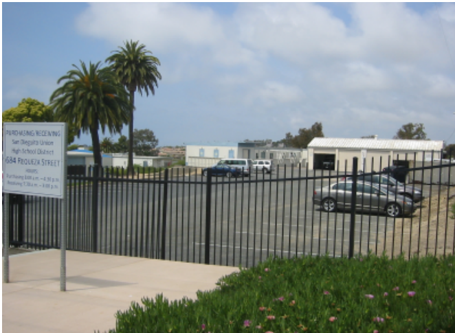
District Purchasing/Receiving - Upper Tier of Site