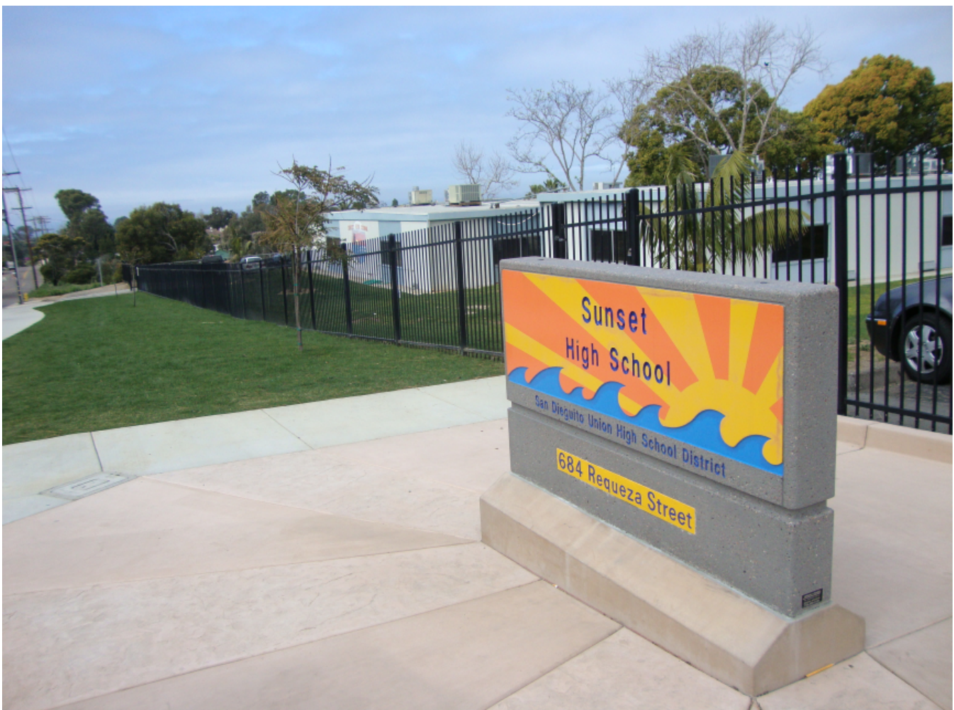
Sunset High School Signage along Requeza Street