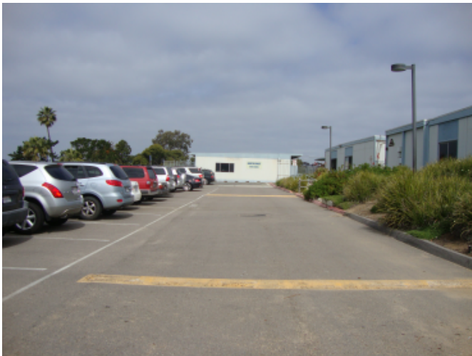
Parking Lot at Lower Tier of Site