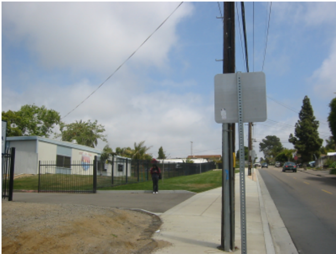
Front of Campus, Along Requeza Street, Looking North