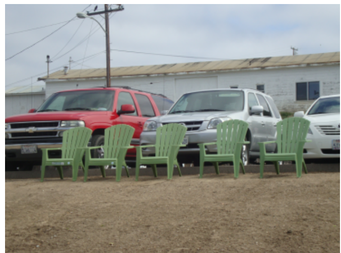
Lounge Area with Ocean View