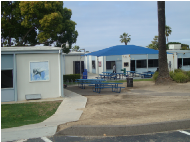
Outdoor Sitting Area